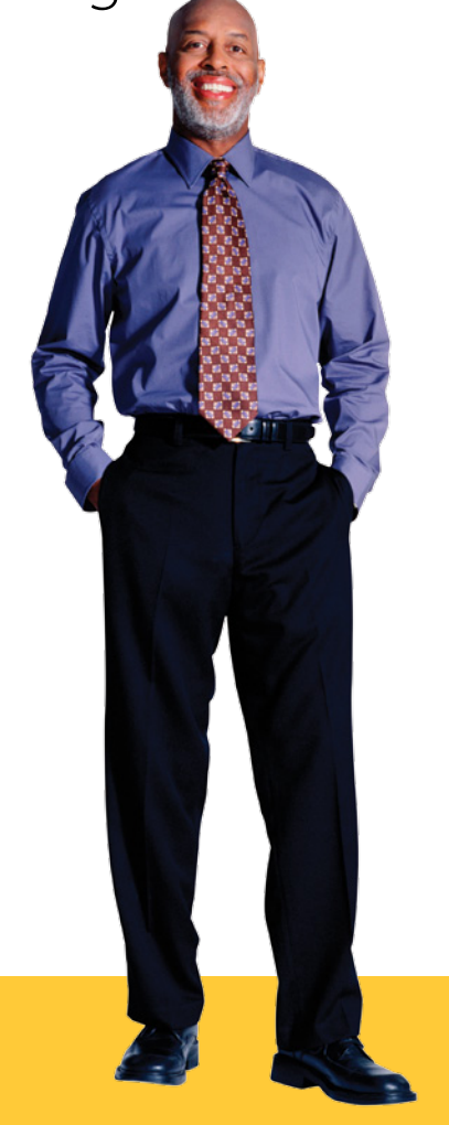
What you can do:

In some cases, you may find it helpful to refer to our cultural competency training and resources for information on understanding and effectively communicating to culturally diverse patients who are at risk. (See page 11 for more on how to access these materials on Cigna's websites at no charge.) You may also encourage your patients with Cigna coverage to learn more about the health advocacy programs available to them through their Cigna medical plan. They can find this information by calling the toll-free number on their Cigna ID card or by logging in to myCigna.com (Manage My Health > My Health Programs & Resources).